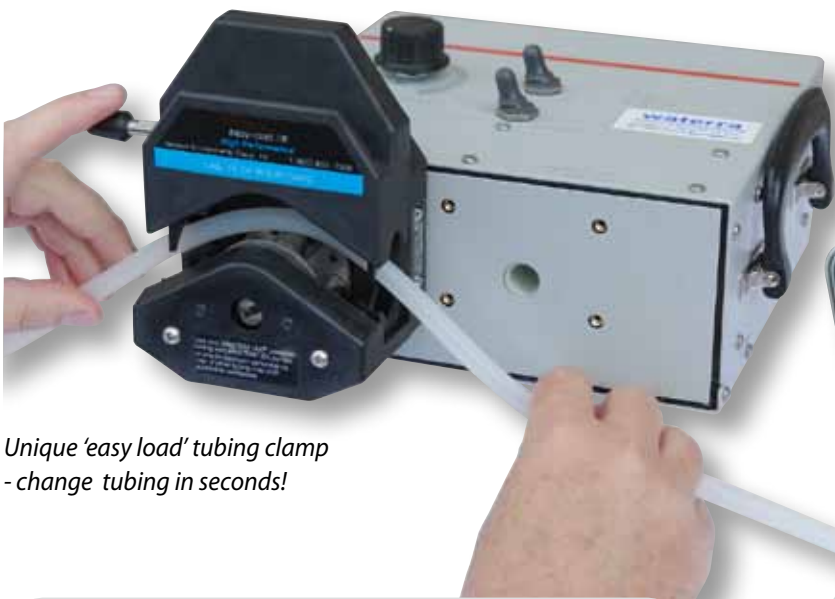
Unique 'easy load' tubing clamp - change tubing in seconds!